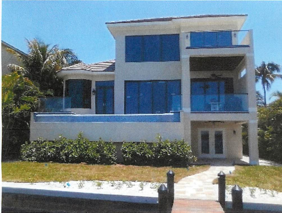
LEFT VIEW 4/29/13