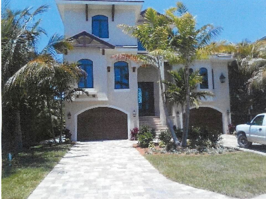
RIGHT VIEW 4/29/13